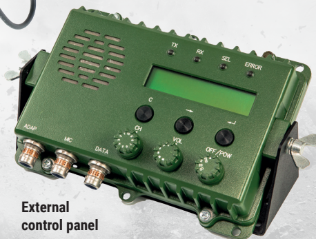
External control panel